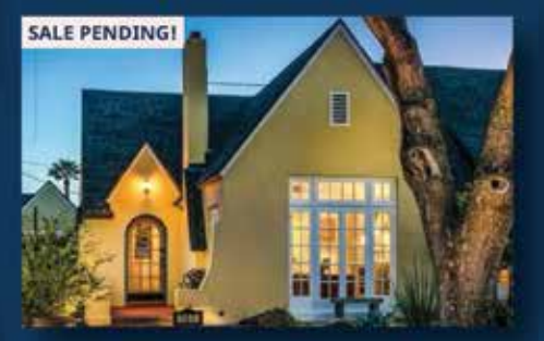
107 West Granada 1,238sq' 2br/1ba + 500' casita $800,000

83 West Cypress 3,350sq' 3br/2.5ba/2CG $1,250,000